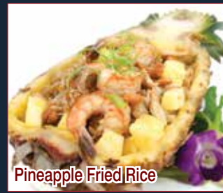
Pineapple Fried Rice