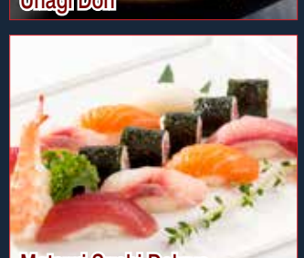
Matsuri Sushi Deluxe