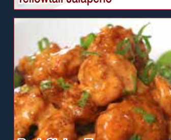
Rock Shrimp Tempura